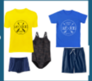
SWIMSUIT WORN TO CAMP WITH LASC SHIRT AND SHORTS 1 PC FOR GIRLS, DRAWSTRING WITH LINER FOR BOYS