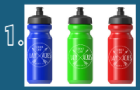
CAMP WATER BOTTLE LOGO LASC BOTTLE