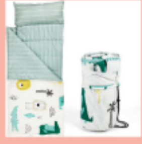
SMALL PILLOW/BLANKET MUST FIT IN SMALL CUBBY